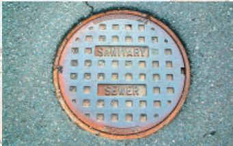
Sanitary Sewer Manhole

The Sanitary System is designed to collect and convey wastewater and is not meant or designed to remove storm water runoff or ground-water which may find it's way into yards or basements. Manholes marked with "SANITARY SEWER" on the lid are for wastewater, while grates are associated with storm water collection: