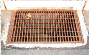
Storm Water Grate